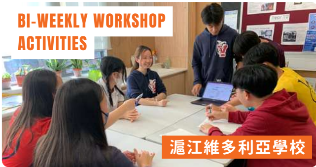
滬江維多利亞學校