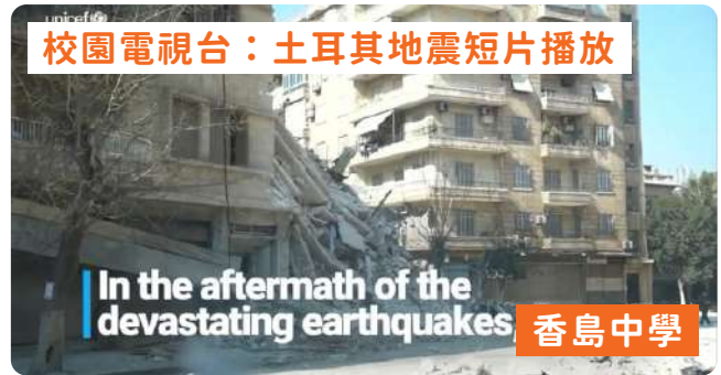
In the aftermath of the devastating earthquakes